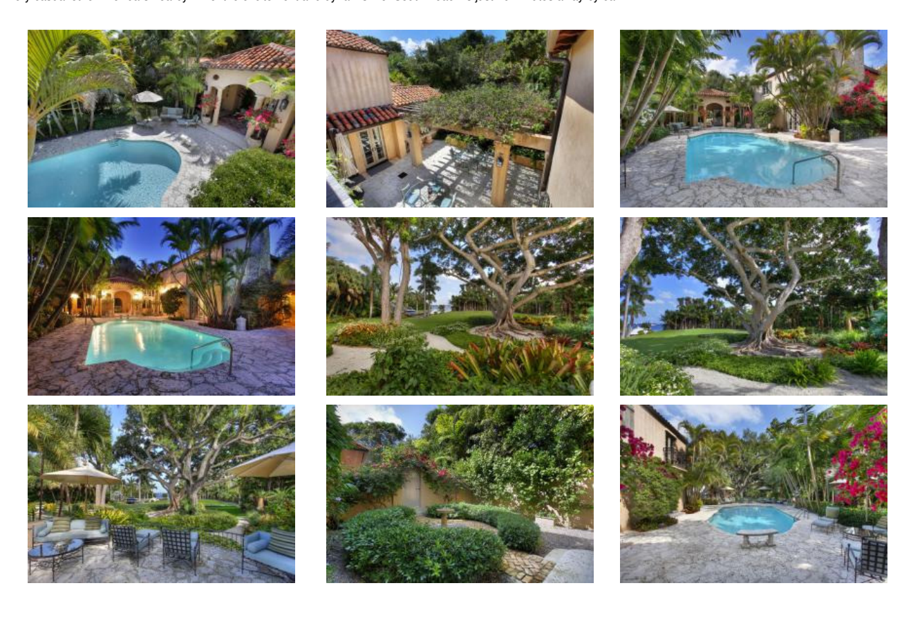
Things you'll appreciate as the next owner include a wonderful pool heating system that makes the pool inviting even on those rare days that winter arrives in Miami, a full house generator system which automatically switches the whole home and all of its toys over to your private electric system in the event of a Florida Power and Light outrage, vault-like hurricane code doors and windows, lots of wine storage, an amazing garden with native specimen-quality tree collection, a private dock served by water and electric, a system of energy-efficient electric "you'd swear it was real" logs in the several fireplaces and a location-location within minutes from Miami, only 20 minutes from Miami Beach and 15 minutes to Miami International Airport.

Angler's Club which Edsel Ford gave his wife for her birthday, not bad Edsel) or to really 'rock it with the nighttime mix of very high end downtown waterside restaurants or very casual other river bars nearby. All of the excitement and dynamism of South Beach is just 20 minutes away by car.